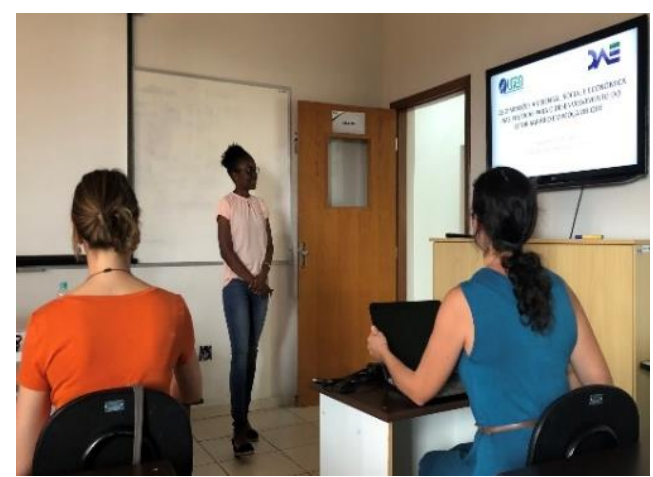
Figure 2 BHEARD scholar from Mozambique during her thesis defense.