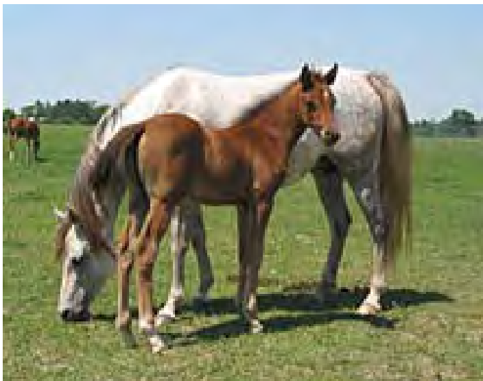
2003 Foal Crop - MSU Arabian Breeding Program