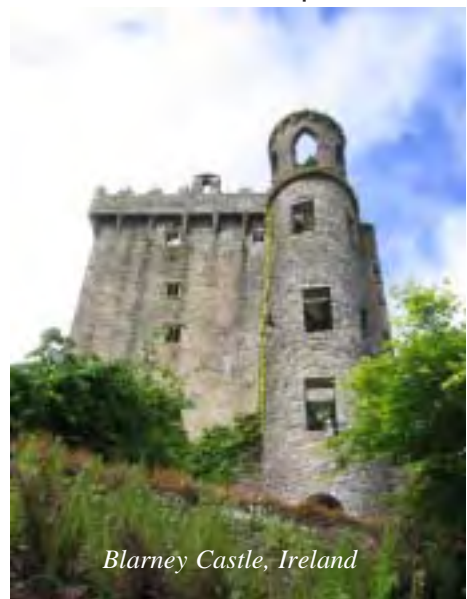
Blarney Castle, Ireland