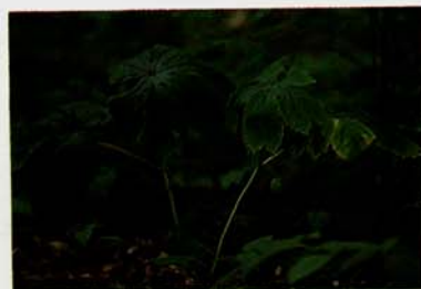
14. PODOPHYLLUM PELTATUM

Native herb of woodlands with umbrella-like leaves and creamy white flowers beneath, fruit is a large fleshy berry, eventually turning yellow by fall, with thick fibrous roots and creeping rhizomes.