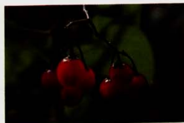
19. SOLANUM DULCAMARA

common black- harmful most parts. Natural places similar fruit a c