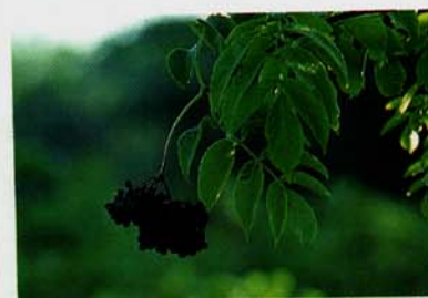
15. SAMBUCUS CANADENSIS

common berries harmful leaves and un Native s open pla pith, flo rounded topped fruit a orange-r purplish