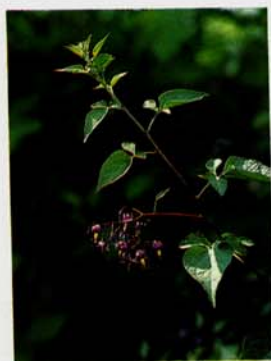
18. SOLANUM DULCAMARA

common names: bittersweet, red nightshade.