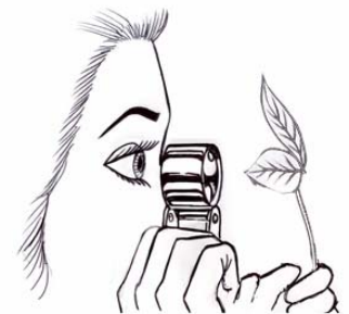
Fig. 1 using a hand lens.