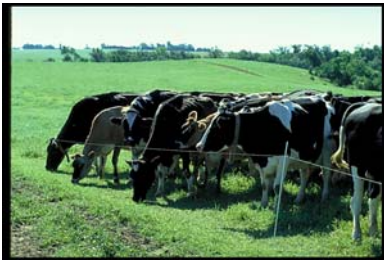
Grazing vs Confinement Dairy