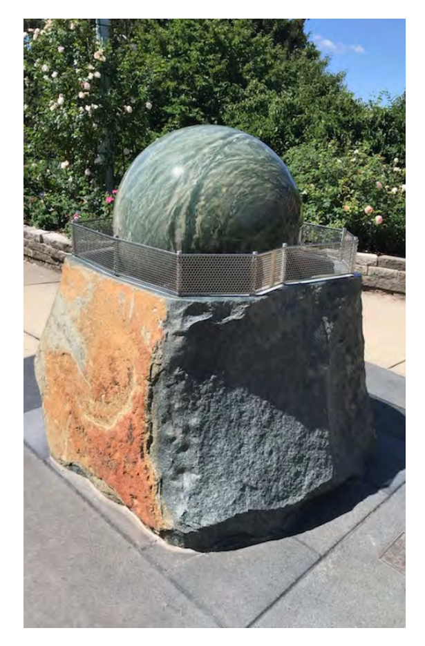
The Ball Fountain