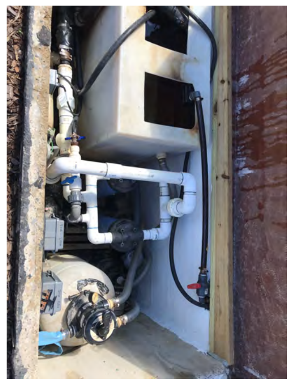
In the pit