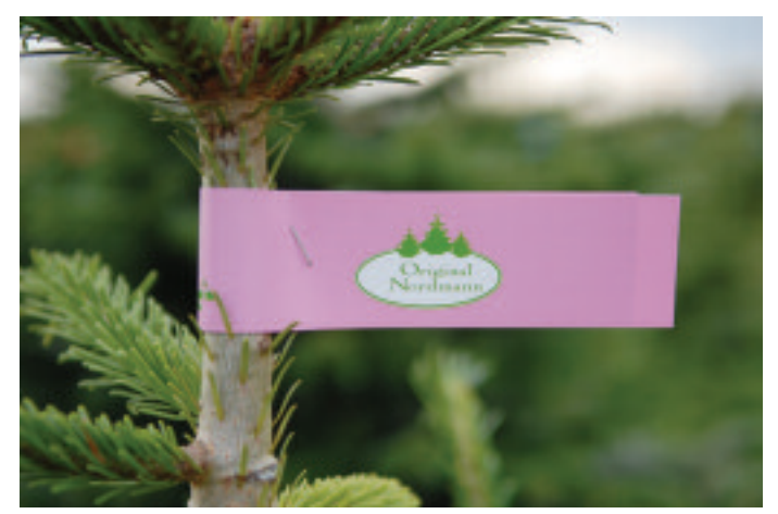
Showing the flag. Nordmann fir are marketed in Europe under the "Original Nordmann" label.