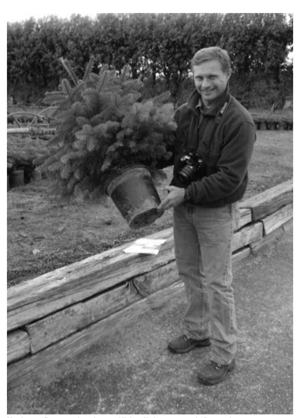
Nordmann fir are marketed as 3-4' living Christmas trees in Denmark.

"Ambrolauria has been widely touted as the best source of Nordmann fir in the United States, however, most Americans