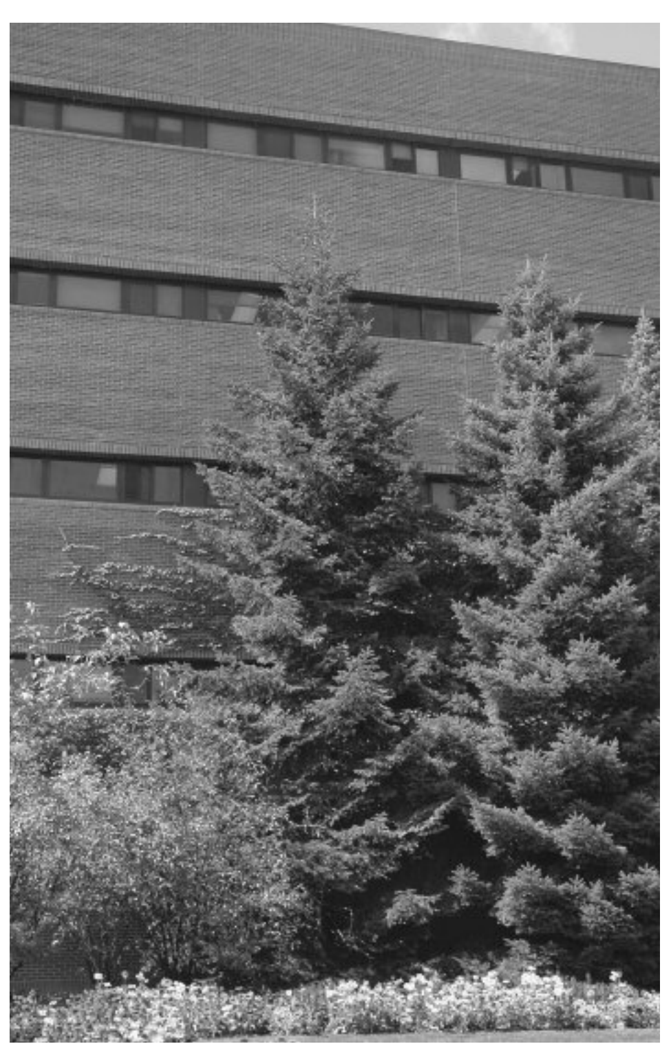
Nordmann fir (on left) is also an outstanding ornamental tree as shown by this specimen at the MSU Plant and Soil Sciences building.

Related species: The taxonomy of the Mediterranean firs is muddled due in part to wide variation within species and also hybridization among species. Turkish fir and Trojan fir are closely related to Nordmann fir and are sometimes listed as separate species ( Abies