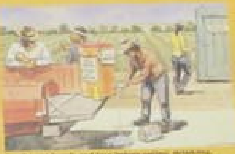
Name and bands and yet before printing stratum, and the banks. I print he desired the transfer or before the banks.