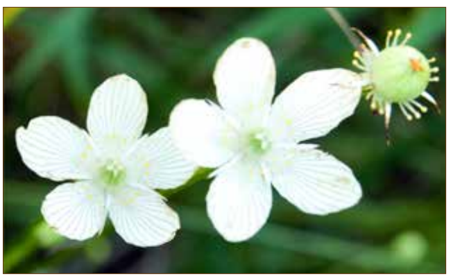
C=10 Color: white 5 regular parts