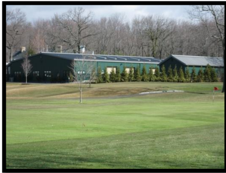
View of Environmental Care Center from 17 th fairway