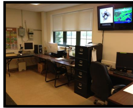
Open office: Includes microscope station, irrigation central computer, assistants desks, and video messaging screen