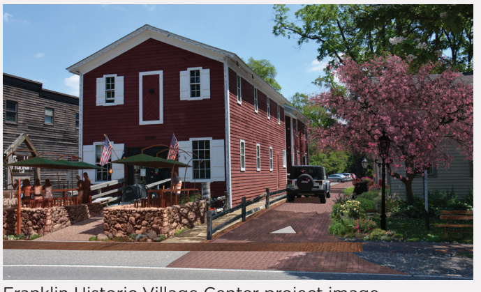
Franklin Historic Village Center project image.

than a decade of success of the Small Town Design Initiative by providing a "go-to" source for Michigan's communities for physical sustainable design assistance in community development and land use.