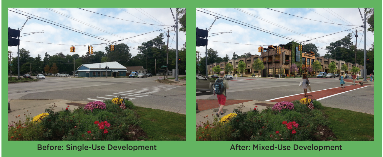
Meridian Charter Township project before-and-after images, which are part of their Community Sustainability Plan.