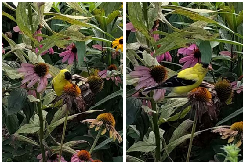
Connie Marcangelo, AGL of the Rain Garden, Captured these Photos of a Yellow Finch Snacking on Coneflower Seeds