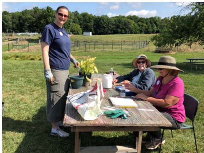
The Nursery Team Prepares Inventory for Fall Donations and Fall Plant Sale