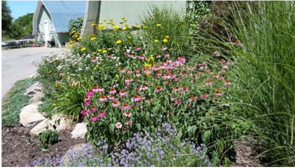
South Xeriscape Garden