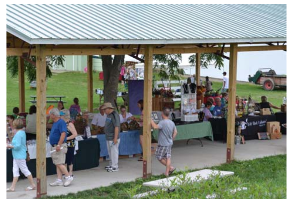
2017 “Sunset Garden Celebration”