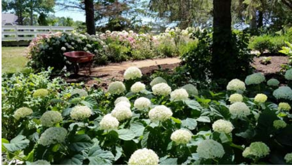
Hosta Garden and Farmhouse Garden