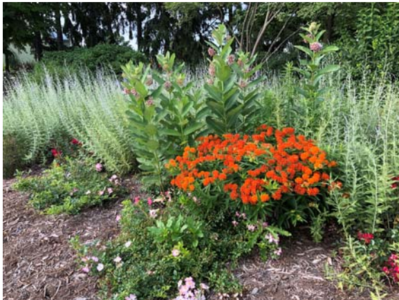
Constructed Wetland (Pond) Gardens