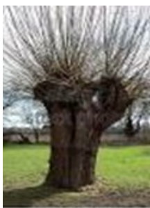
Example of Pollarding

While researching this article I came across information on another pruning technique called Coppicing. Coppicing and Pollarding are ancient practices used mostly in Europe to grow firewood, and to prune for aesthetics. Trees can be continually harvested for fuel and craft materials. By cutting a young deciduous tree, it will send out new growth in spring which can be harvested, usually in a few years. The best trees for this technique are oak, hazel, ash, chestnut and willow. Of these trees, the willow is the most useful, as it grows quickly, and is similar to hardwood in its heating capacity used as firewood.