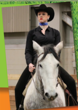
MSU Stock Seat Equestrian Team hosted the Intercollegiate Horse Show Association meet.