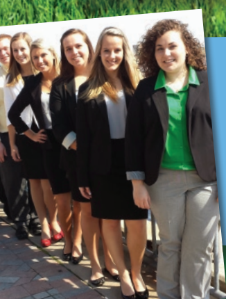
The 2014 National Agri-Marketing Association Team.