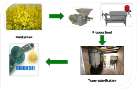
Figure 1: Basic overview of biodiesel production from canola oil

As more and more scientific evidence accumulates, it is becoming increasingly clear that the use of petroleum fuels and the green house gases associated with them are doing damage to the global climate. Carbon existing in the oils stored within the Earth's crust are burned and released into the atmosphere faster than it is replenished by natural forces. Biofuels, on the other hand, are constructed from carbon taken from the air in the form of plant matter. This leads to a balanced cycle where carbon is taken from the air in equal amounts to that when it is burned as fuel. Due to this more balanced cycle, it is critical for biofuels such as biodiesel to replace as much fossil fuels as possible. The following diagram gives an overview of the processes involved in biodiesel production starting from vegetable oil. The rest of the document is dedicated to explaining biodiesel production more broadly.