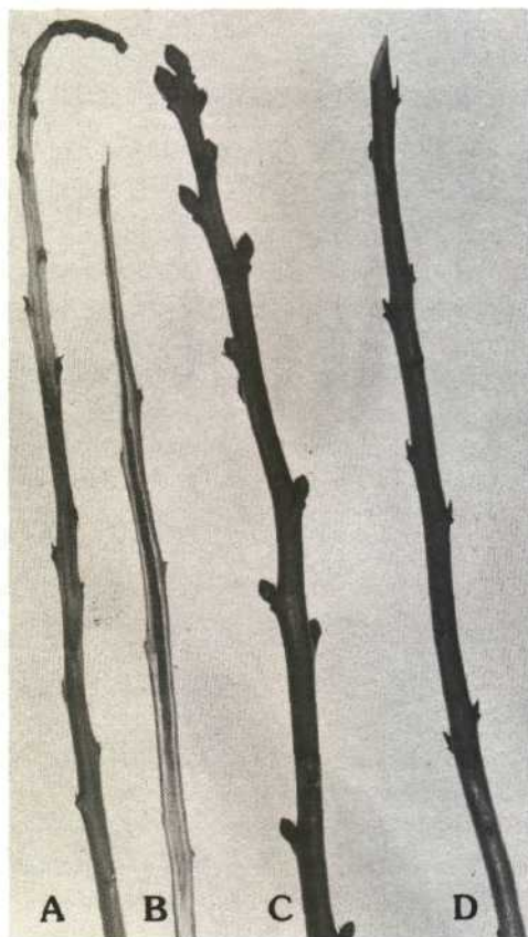
Figure 2. Examples of desirable and undesirable shoots for cuttings: A) poor shoot with external symptoms of winter injury; B) undesirable shoot with internal symptoms of winter injury; C) poor shoot with flower buds and D) healthy shoot ideal for propagation.

Rooting medium —Pure ground peat is generally used in Michigan for propagation. Mixtures of peat, sand and Perlite can also be used, but some varieties like Bluecrop root best in pure peat. The rooting medium should be soaked for 3 to 4 hours before planting to insure uniform moisture distribution. The medium should be at least 4