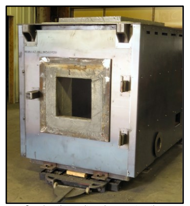
Combustion unit under construction

builds 8-12 units per year and now has 114 major installations across much of the United States, with nine Michigan facilities. There are only about a halfdozen manufacturers of this sort in the USA.