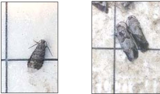
Cherry fruit worm (left) and the contaminant found in cherry fruitworm traps, Pseudexentra vaccinii (right).

We have started to catch a moth in cherry fruitworm traps that is not cherry fruitworm. This "contaminant" moth is Pseudexentra vaccinii and is commonly caught in cherry fruitworm traps. Although it reportedly may feed on blueberry; we have never found it to be a pest of any economic consequence in Michigan. The contaminant moth is ~½ inch long which is much larger than cherry fruitworm which is ~¼ inch long. Cherry fruitworm also have an iridescent banding pattern while the contaminant moth has darker markings on a light gray body. See the photos below to help with identification.