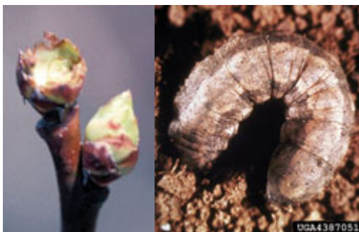
Left, cutworm damage, right, cutworm larva on soil.

During this time of year when night time temperatures become milder, and flower buds and leaf buds are beginning to swell and grow, you may see two insect pests, cutworms and spanworms, which may feed on new growth. Both pests are moth larvae that are occasionally