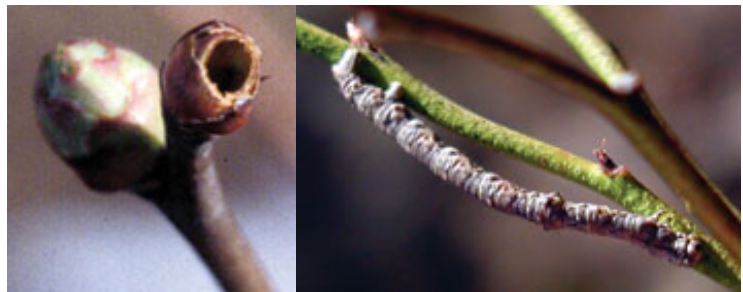
Left, typical spanworm damage, right, spanworm larva mimicking a twig.

Several species of spanworm (inchworm) larvae feed on blueberry, where they chew holes through the sides or tops of buds. These insects have thin bodies with large fleshy legs only at the front and rear ends of the body. Their coloration makes them well camouflaged in blueberry bushes.