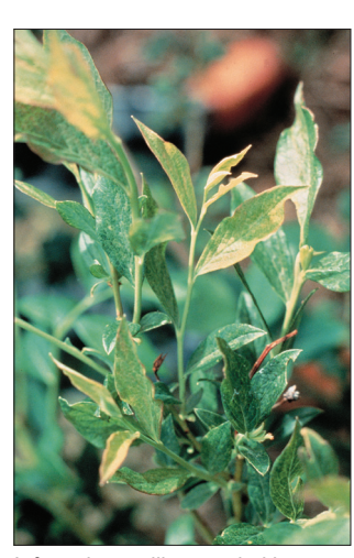
Infected, straplike, mottled leaves.

The virus is vectored by dagger nematodes (Xiphinema spp.) and has a wide host range, including chickweed, dandelion, narrowleaved plantain, and fruit crops such as apple, grape, peach, and raspberry. It is seed-borne in many of its hosts. These plants can act as a reservoir of virus for nematodes feeding on their roots.