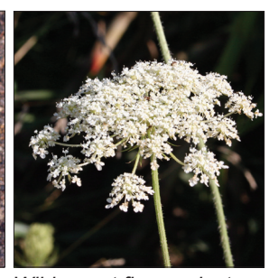
Wild carrot flower cluster.