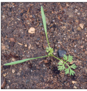
Wild carrot seedling.