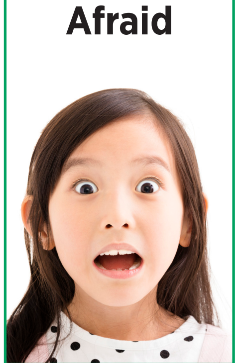
The "Emotion Cards" handout originally appeared in the Heads In, Hearts In activity "Feelings Masks" by Michigan State University Extension, 4-H Youth Development, 2017.