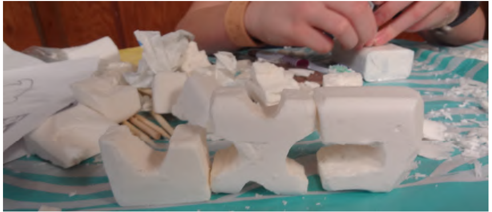
Michigan 4-H 2020 Winterfest participants

Do it, What happened, What's important, So What, Now What?