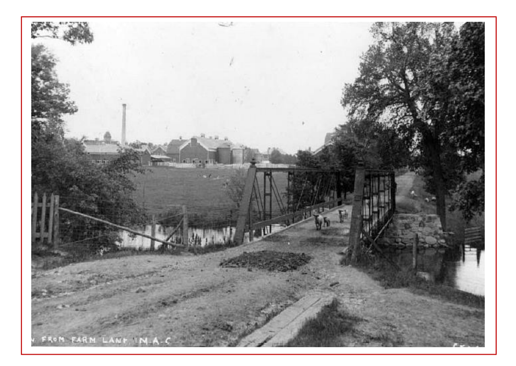
Farm Lane looking North over Red Cedar River Bridge - 1920