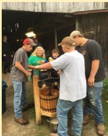
Alpena County 4-H Members work together to make apple cider at the annual Hay Rustlers 4-H club Harvest Day!

The February 24th meeting will be with a KENT feeds representative.