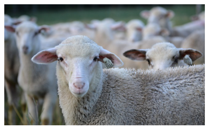
Figure 2. Scrapie tag on a sheep.

All sheep being moved within or outside of Michigan are required to have an official U.S. Department of Agriculture (USDA) scrapie program identifier before being moved off the farm. It is illegal to remove an official USDA individual animal identification method, so don't remove these objects before sale, weigh-in or exhibition.