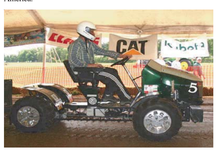
Practice Pull, Wheel Spinners and All

Through involvement in the competition, students gain practical experience in the design of drive train systems, tractor performance, manufacturing processes, analysis of tractive forces, weight transfer, strength of materials, and ergonomics. It has given thousands of students hands-on, real-world engineering experience that will help them in upcoming courses and prepare them for future careers. The competition also provides students and opportunity to meet corporate sponsors such as AGCO Corp., Bridgestone/Firestone, Briggs & Stratton Corp., CLAAS, CNG, Caterpillar, Deere & Company, The Grasshopper Company, Kubota, and New Holland North America.