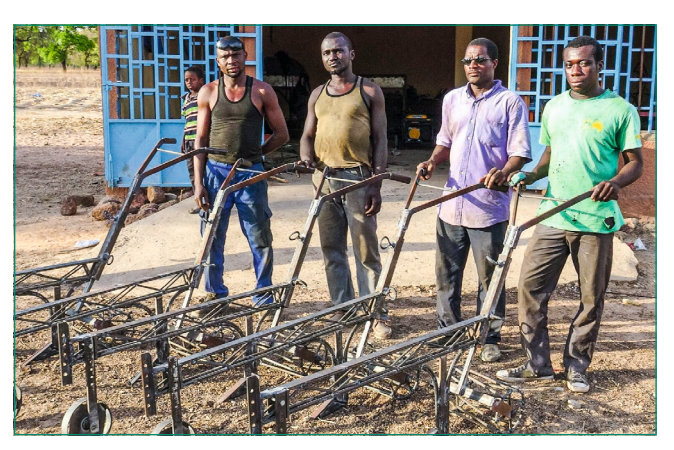
Figure 6 – Local artisans are collaborators actively involved in setting priorities, evaluating alternatives, and sharing work results