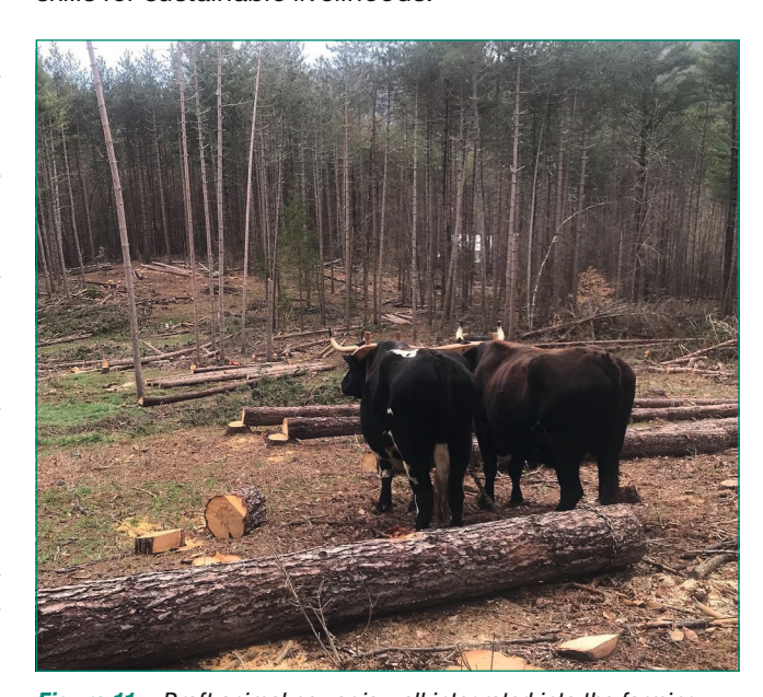
Figure 11 – Draft animal power is well integrated into the farming system at Earthwise Farm and Forest

Carl B. Russell and his wife, Lisa McCrory, own and operate Earthwise Farm and Forest in Bethel, VT. They raise organic vegetables and grass-fed livestock, use draft animals for logging and fieldwork, and offer workshops on skills for sustainable livelihoods.