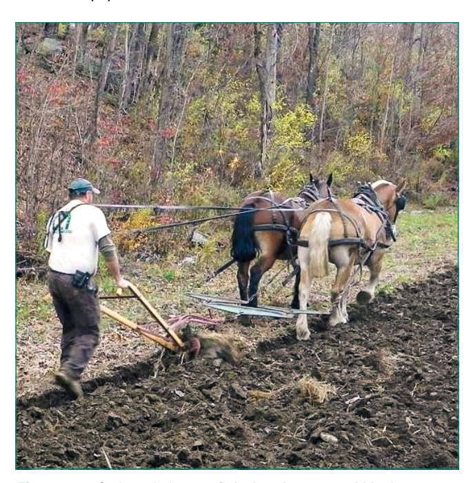
Figure 12 – Carl maximizes profit by keeping costs within the capabilities of animal-based production rather than through increased mechanical production to cover higher costs

One of my strategies for using draft animals most effectively in our operations has been to engineer the scale of work to reduce their role to the most appropriate tasks. Our land-use systems that require motive power are purposefully limited to a scale that fits our animals' time and energy constraints and capabilities and affordable associated equipment.