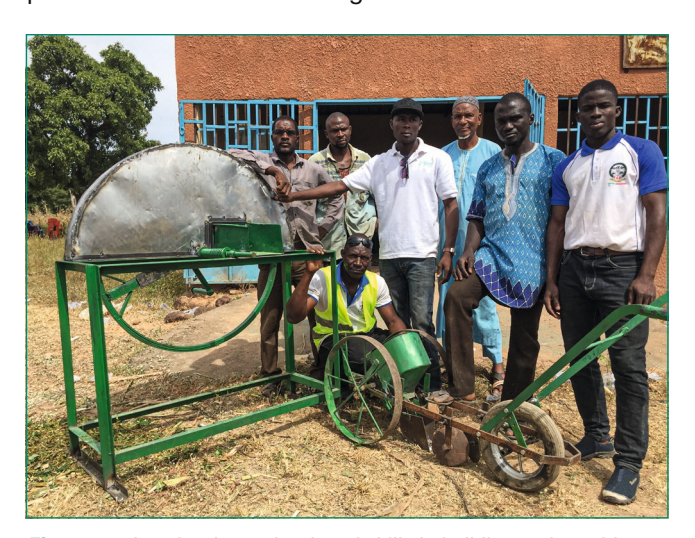
Figure 4 – Local artisans developed skills in building and repairing planters and other implements with local materials

Appropriate scale technologies must be accessible to smallholder farmers. Mechanization and mechanical skills are insufficient at the farm and village levels. The supply chain and infrastructure for timely access to replacement parts, services, and repairs for imported equipment is generally nonexistent. There is a need to develop the mechanical skills of farmers and local artisans to efficiently use animal power. Worldwide, where mechanization took hold, the process has been stepwise and incremental, resulting in less labor-intensive farming systems. In our experience, improving tools for animal traction is one of the best ways to improve the lives of poor farmers while sustaining the natural resource base.