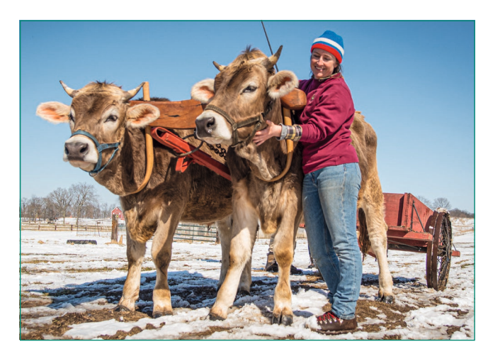
Figure 17 – Tillers International draws on historical examples of functional farming tools and implements to help local communities produce affordable tools

a collection of historic farm implements. In practice, we help communities locally produce affordable tools. Historically, human or animal-powered devices — simple though sophisticated — are easy to replicate without a significant investment in manufacturing facilities. Repair parts can be fashioned affordably by local artisans ensuring availability when the growing season demands.