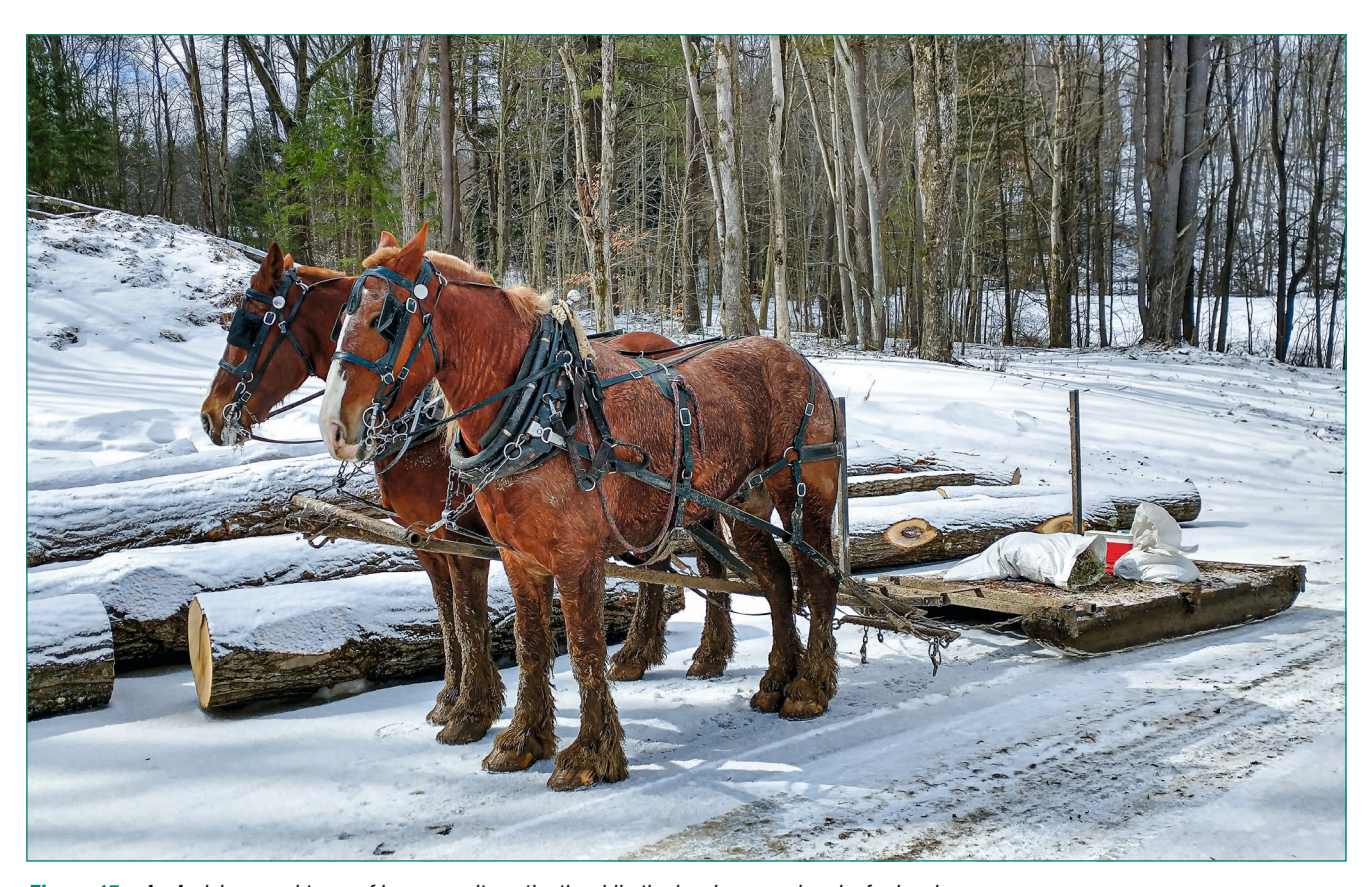
Figure 15 – An Amish-owned team of horses waits patiently while the logging crew breaks for lunch

This is not to say that farming with horses is a life of idyllic