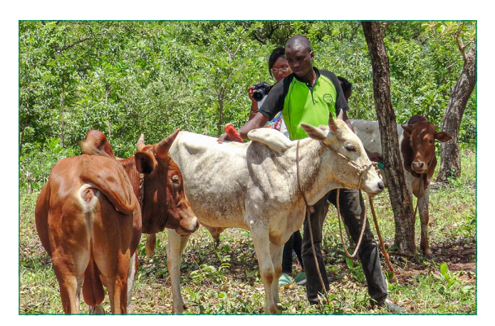
Figure 9 – The implement draft dropped from 90 kgf with the moldboard plough to 45 kgf with the strip tiller, easing the burden on the local small-framed oxen

In an adaptive management process, we built and evaluated a set of technologies compatible with the local economic, social, and environmental conditions. We redesigned an animal-drawn planter introduced decades earlier but widely rejected by local farmers because of the high cost and poor performance. We reduced the cost of the planter by 50 % by replacing an expensive imported spiral bevel gear drive with an open spur gear drive built on-site by local blacksmiths. We had made mold-injected seed plates for maize, sorghum, millet, and cowpea and an innovative furrow opener to place the seed at the correct depth. Locally built, concave discs well suited for clearing crop residue without plugging replaced the high crown furrow closers on the old-style planter. Finally, we reduced the press-wheel width by 50% to provide localized pressure to firm the soil in the narrow seedbed created by the in-line ripper. The refined planter's average implement draft was 20 kilogram-force (kgf), a manageable load for even a single donkey.