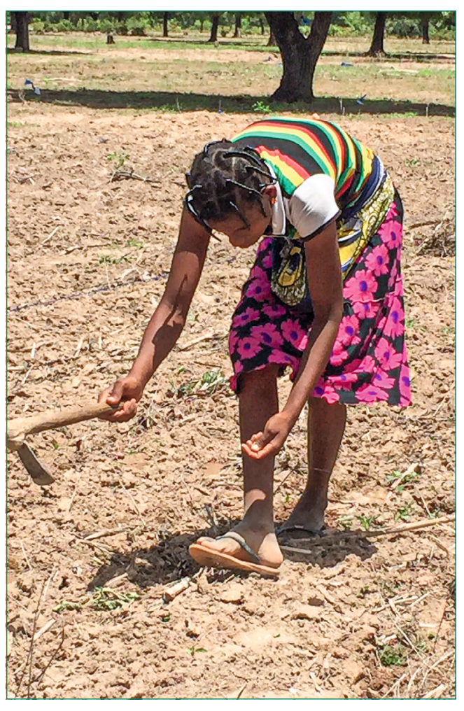
Figure 2 – Young Burkinabé woman planting maize by hand with a 'daba'

Our recent work in Burkina Faso, a small, landlocked country in West Africa, is an excellent example of where animal traction is the most appropriate technology. Ninety-two percent of the population of Burkina Faso is involved in agricultural pursuits4. Smallholder farmers typically work less than 3.5 hectares of land, mid-size farms are about 7 hectares, and large farms are 10 hectares. Forty-five percent of the farms have an income of less than $3 per day. Nearly the entire rural population relies on subsistence farming and lives in poverty.