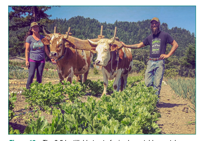
Figure 19 – The 2.5 ha tillable tract of mixed vegetables matches human and animal work and time constraints. Two covered greenhouses extend the growing season to a year-round operation

We transitioned from tractor to ox power, from conventional intensive tillage (plow, disk, fit, plant) to draft animal-appropriate, reduced tillage, raised beds. Most vegetable gardens in the region are smaller (one-quarter hectare or less) than our 2.5 ha plot. Ox power gives us longer and stronger arms--a level of tractive efficiency greater than human power or two-wheel tillers, but right-sized for our time and land base. Most of the implements used in the garden are modern, multi-purpose or vintage tools modified to achieve specific tasks. The goal is to have a one-person operation for the fieldwork.