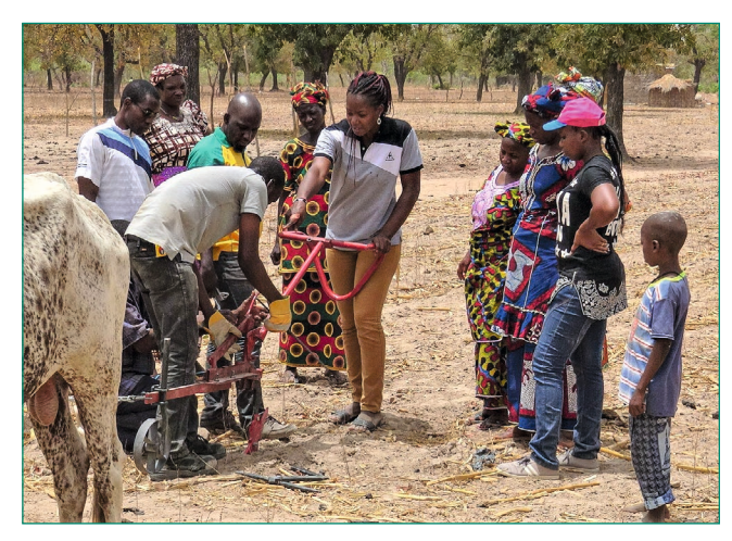
Figure 3 – Interaction and collaboration with local farmers is essential in understanding opportunities to redesign local farming systems

ficiency, 2) substitution, and 3) redesign<sup>5</sup>. Efficiency is in targeted placement and tighter control of fertilizer and crop inputs to improve crop response. Substitution replaces existing technologies with more effective ones such as improved crop varieties or no-till cropping rather than inversion tillage. A redesign aims to deliver "the optimum amount of ecosystem services to aid production while ensuring that agricultural production processes improve the ecosystem they depend on." A redesign can strengthen the agroecosystem by adding regenerative components.