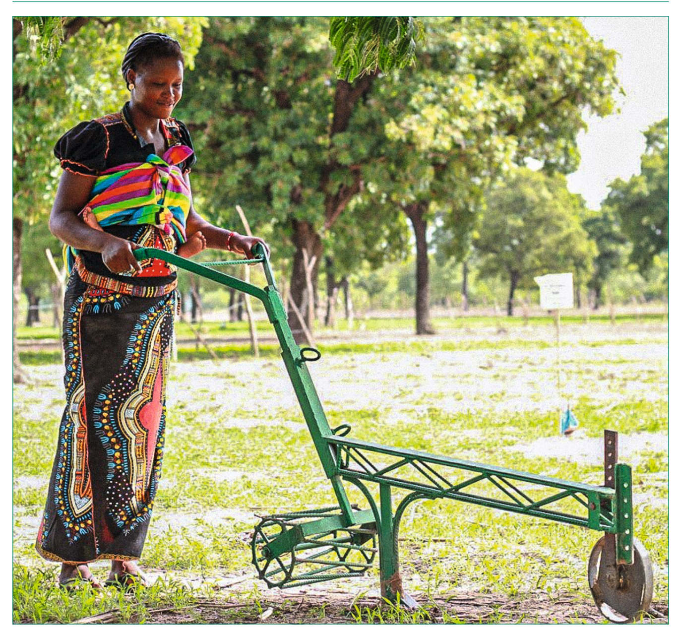
Figure 8 – Strip-tillage builds soil health by conserving soil moisture, reducing tillage intensity, and retaining a protective crop residue on the soil surface

Our approach to redesign farming systems is agroecological – a production system, not a simple technology. Machines and draft animals are part of a broader system where ecological and social benefits are valued and sought after. Our goal is to offer flexible options compatible with the local economic, social, and environmental conditions and enhance the farming system's efficiency and resilience. Our approach is participatory. Local farmers and artisans are collaborators actively involved in setting priorities, evaluating alternatives, and sharing the work results. Participatory development enhances farmers' capacity to learn about farms and resources.