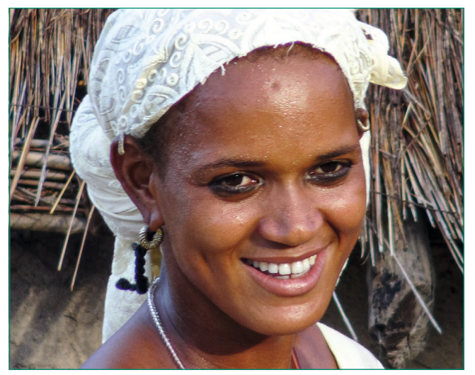
Figure 10 – Time saved with the planter allowed women to divert time from subsistence farming and household chores to income-generating activities such as processing shea butter or cashew nuts

Agroecological concepts ground our approach to farming systems redesign. Evaluation is technical but viewed in social, cultural, and economic contexts. After one or two seasons of use, a group of women commented on the time and laborsaving impact of the animal-drawn planter on their lives. They noted that a family of three with a team of oxen could accomplish the work of a hand-planting crew of 15-20 laborers. The women used the time saved with the planter to perform other domestic tasks such as cooking, fetching water, child-care, and going to the market7. They could divert time from subsistence farming and household chores to income-generating activities such as processing shea butter or cashew nuts. Income from their off-farm enterprise funded children's schooling, food, and clothing. In addition, they saved money for unexpected expenses such as medical care and other family emergencies.