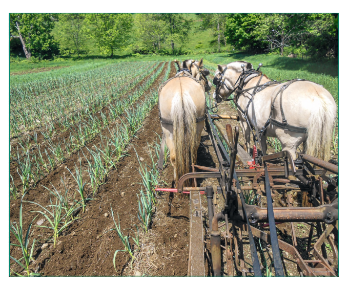
Figure 13 – Cultivating garlic with a team of Fjords at Cedar Mountain Farm

Stephen Leslie is a co-owner of Cedar Mountain Farm and Cobb Hill Cheese, located in Hartland, VT. The farm produces milk, beef, mixed vegetables, and compost.