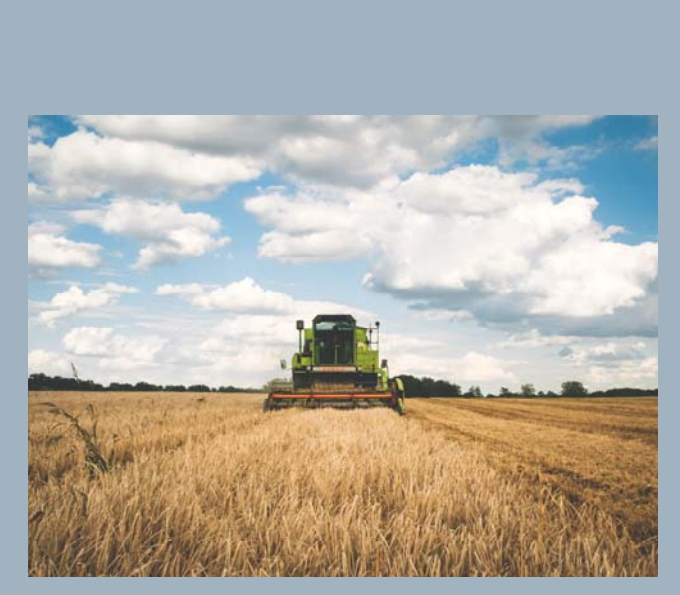
More than 50% of land in Bay County is used as farmland.

In 2018, ten one-time presentations were held in Bay County reaching 170 adults. Through these presentations, 852 children aged 0-8 and 27 children aged 9-12 were impacted. Topics presented include screen time for young children, resiliency, positive discipline and social emotional health.