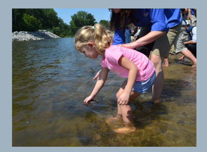
Many community members helped release Lake Sturgeon into the Cass River.

The Lake Sturgeon fingerlings released in August won't return to spawn in the Cass River until 2038 when they reach adulthood!