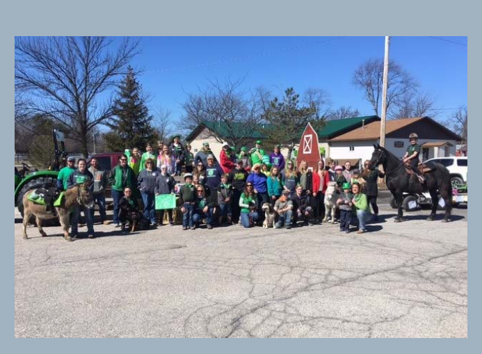
4-H youth, volunteers, and parents participating in the St. Patrick's Day Parade.