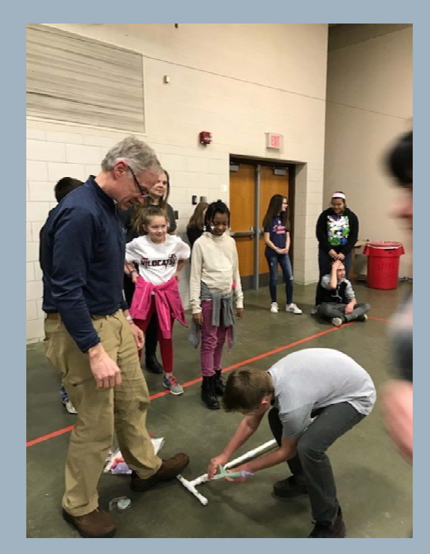
Handy Middle School students learn about rockets and aerodynamics.