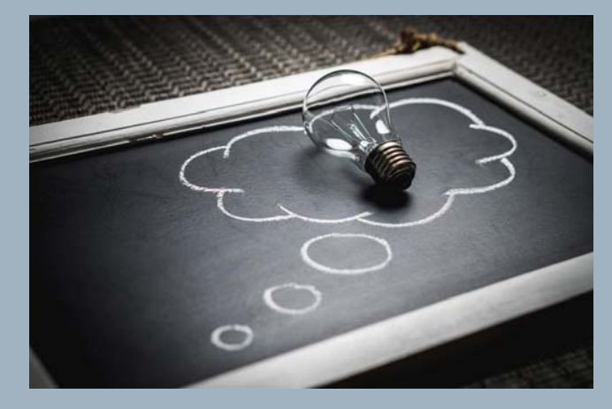
Mental health is important at every stage of life, from childhood and adolescence through adulthood.