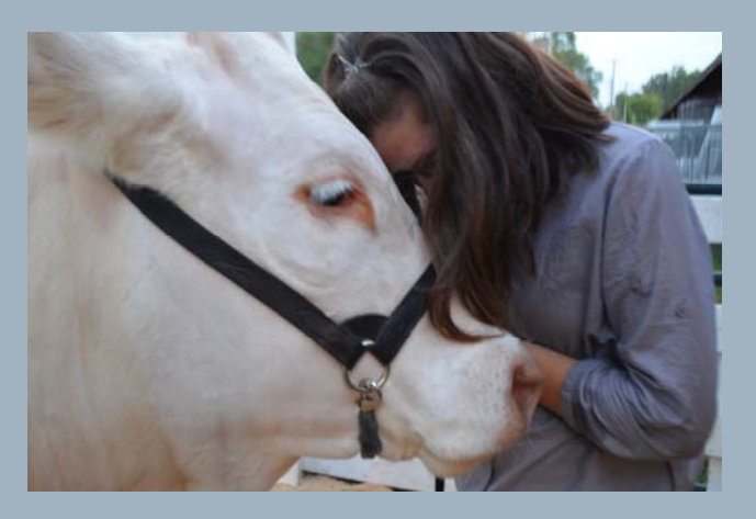
A touching moment between a 4-H youth with her steer at Bay County's Livestock Auction.