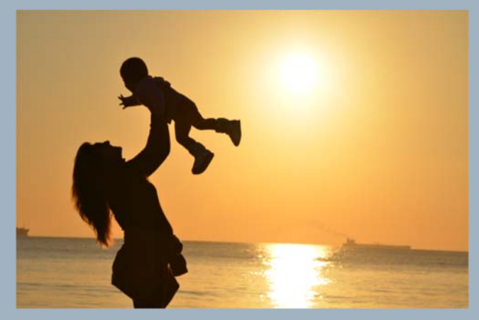
According to the CDC, the first eight years of a child's life is foundational for his/her lifelong health, learning and success.