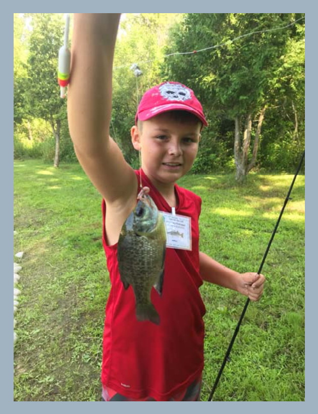
The Saginaw Bay 4-H Fish Camp helps recruit the next generation of anglers while teaching them about Great Lakes stewardship.

Campers receive a rod, reel, and tackle box to continue fishing after camp.