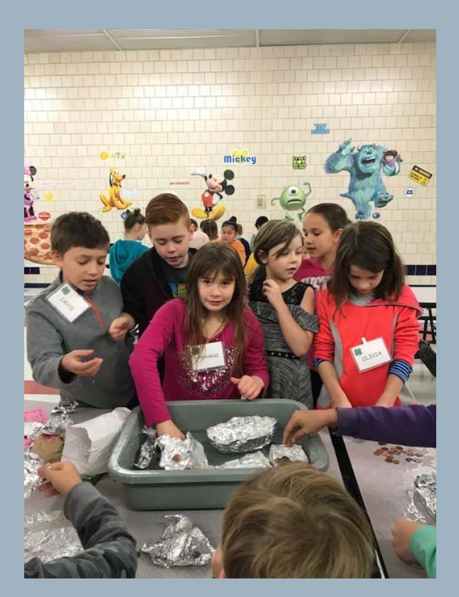
Washington Elementary Tech Wizards learn a lesson on buoyancy.