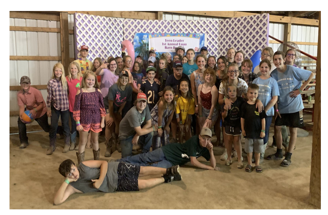
2019 First Annual Barn Dance

The Teen Leaders' had their very first event, a Luau Barn Dance. The teens sold over 100 tickets and had close to 100 youth in attendance. Everyone had a great night stomping their boots! If you want to be a part of planning fun county 4-H events like this, join the Teen Leaders at their next meeting! Their meetings are on the 2nd Wednesday of every month at 6:00 p.m. in the MSU Extension Conference room.