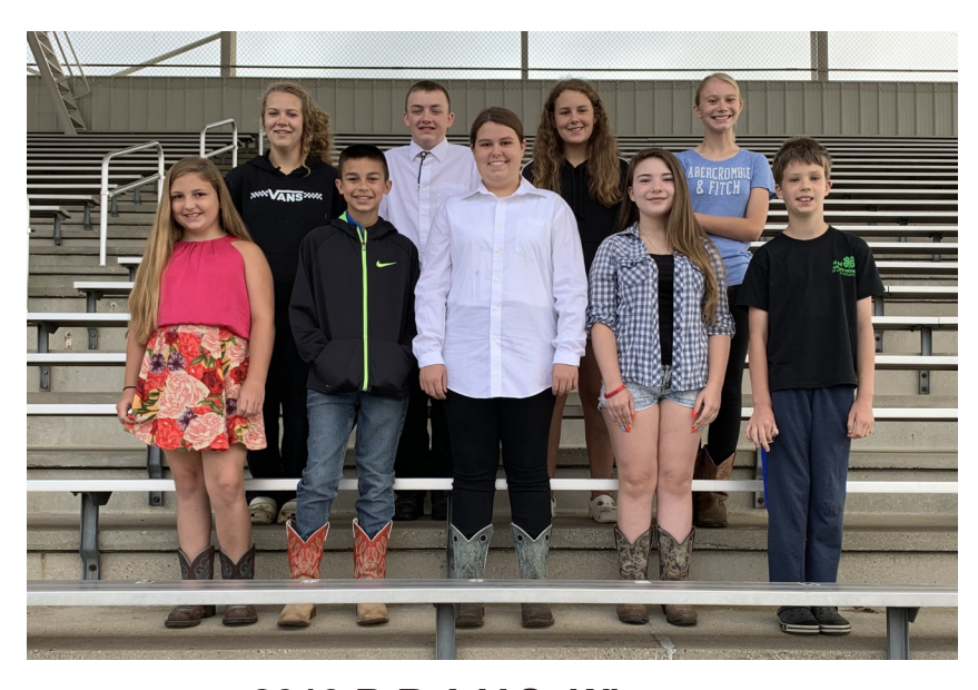
2019 B.R.A.V.O. Winners