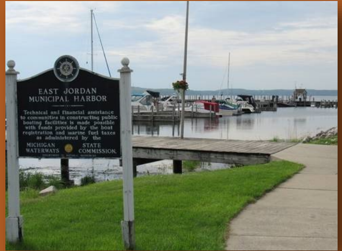
East Jordan Municipal Harbor.