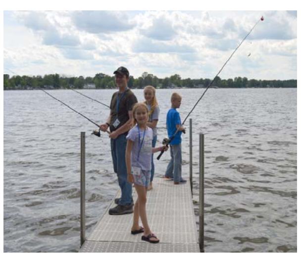
4-H members fishing from the dock is just one of the many experiences youth took part in while attending Camp Clover.

Clare County 4-H held three summer camp experiences that included Camp Clover, Cloverbud Day Camp, Exploration Days, and Forestry Day Camp. A total of 73 youth participated in these camps. Teens had the opportunity to learn leadership and responsibility while leading younger youth through their camp experience. Forestry Day Camp was held in conjunction with the Clare Conservation District and the DNR Huron Pines AmeriCorps program. Campers were able to take a field trip to a forestry products facility and Hartwick Pines State Park.