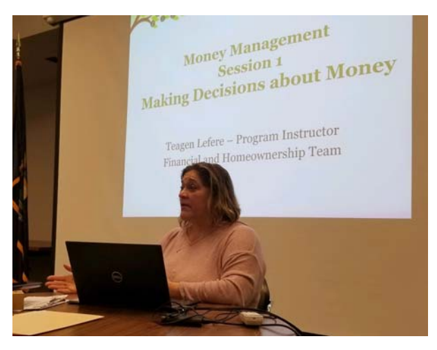
MSU Extension provides the key to success with housing, rental and home buyers' education courses.