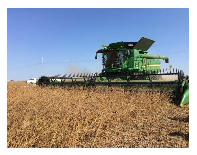
MSU Extension provides education and support to farmers and producers.