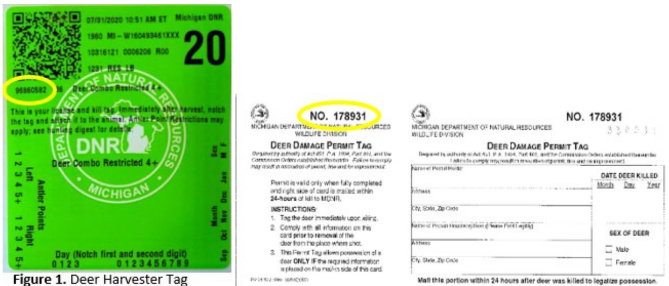
showing (circled) Kill Tag ID number to be used on submission form.

Figure 2. Deer Damage Permit Tag showing (circled) Kill Tag ID number to be used on submission form.