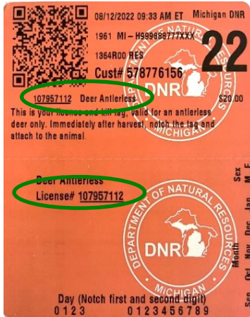
Figure 1. Deer Harvester Tag showing Kill Tag License Number (circled) to be used on submission form.