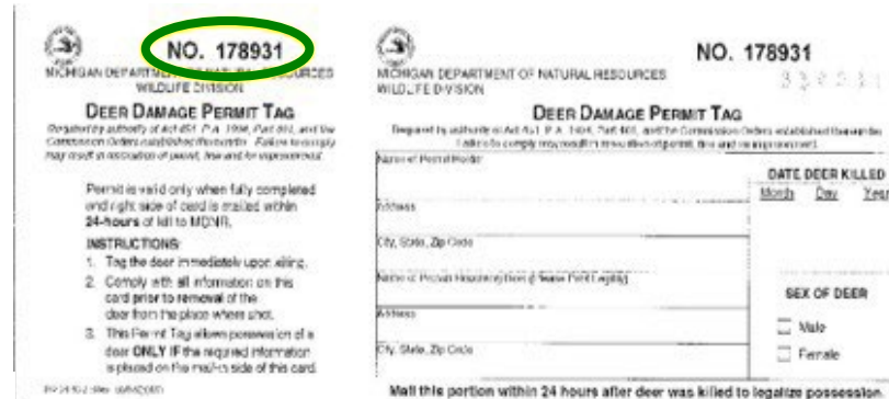
Figure 2. Deer Damage Permit Tag showing Tag License Number (circled) to be used on submission form.