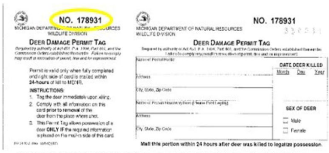
Figure 2. Deer Damage Permit Tag showing (circled) Kill Tag License number to be used on submission form.