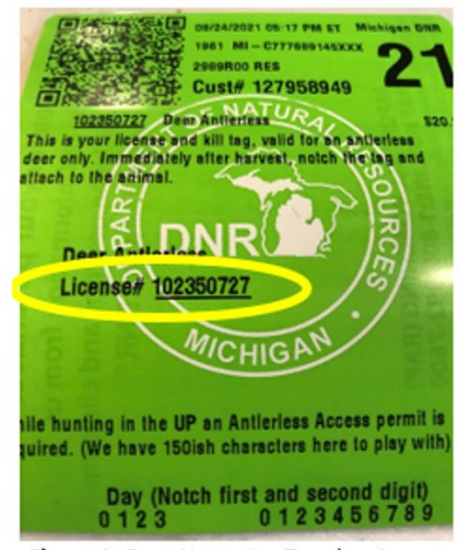
Figure 1. Deer Harvester Tag showing (circled) Kill Tag License number to be used on submission form.