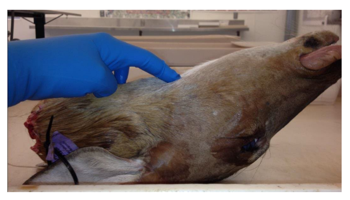
Step 2. Make a U-shaped cut across the neck toward each ear. Your incision should be just behind the jawbone.