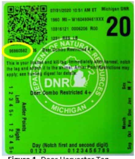
Figure 1. Deer Harvester Tag showing (circled) Kill Tag ID number to be used on submission form.