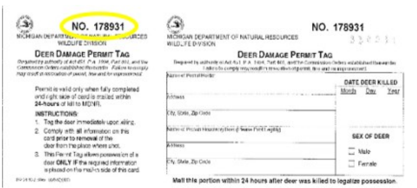
Figure 2. Deer Damage Permit Tag showing (circled) Kill Tag ID number to be used on submission form.