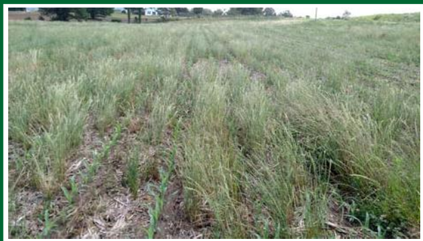
Figure 5. Failed control of annual ryegrass prior to corn planting resulting in crop competition and seed production.

Termination timing in the event another application or different method is required. Occasionally multiple herbicide applications will be required to successfully terminate a cover crop (Figure 5). Early termination allows for flexibility should a second application be needed.