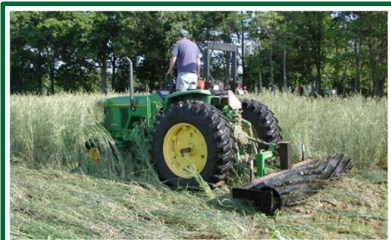
Figure 3. Roller crimping cereal rye (Photo credit: Dale Mutch).

dates. Examples of cover crops that have been successfully terminated using the roller crimper include cereal rye (Figure 3) and hairy vetch. Success is dependent on the stage of the cover crop, with these two species required to reach the point of flowering (Feeke's 10.5/Zadoks 60, for cereal rye). Crimping prior to flowering may result in continued growth. However, waiting until the time of flowering adds the risk that viable seed could be produced, resulting in volunteer plants emerging in the future. Utilizing the roller crimper in combination with herbicides increases the likelihood of successful termination.