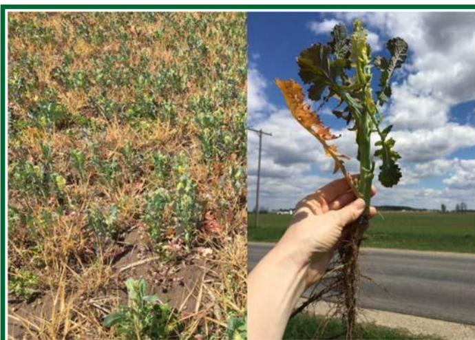
Figure 4 Glyphosate terminated the cereal rye (left), but failed to control bolting rapeseed (right) in this two-species mixture.

Termination prior to flowering. Plants that have started to flower (reached the reproductive stage) may be difficult to control as the movement of photosynthates change in the plant, thereby altering the movement of herbicides that are translocated (Figure 4).