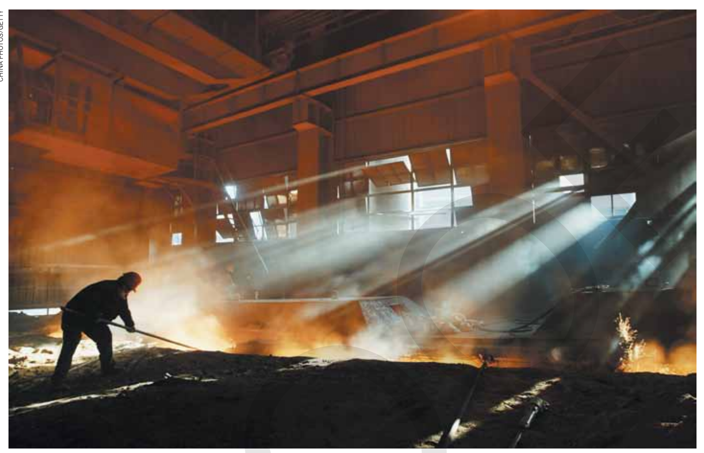
Steel mills and other heavy industries amplify carbon emissions in Inner Mongolia, while the products are consumed in more affluent parts of China.