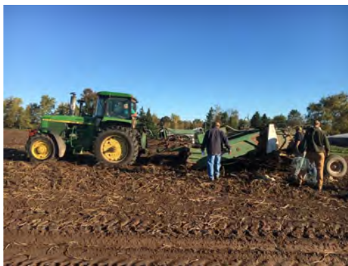
Harvesting Potato Trial

Michigan agriculture continues to be a growing segment of the state's economy. The production of commercial food and nonfood agricultural operations is growing rapidly. The number of households raising a portion of their own food and raising livestock or gardening for pleasure or relaxation continues to increase. When you support MSU Extension, you help participants learn profitable and efficient business and production practices. Participants also learn how to optimize and reduce the use of pesticides and fertilizers, and how to conserve and protect water resources. This education leads to better use of time, money and human capital, and helps retain and create agricultural jobs. These measures strengthen Michigan's economy while connecting farmers to local food opportunities and global markets. In this way you help MSU Extension encourage growth in a sustainable and prosperous Michigan food and agriculture system.