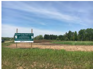
Site of Cover Crop Research