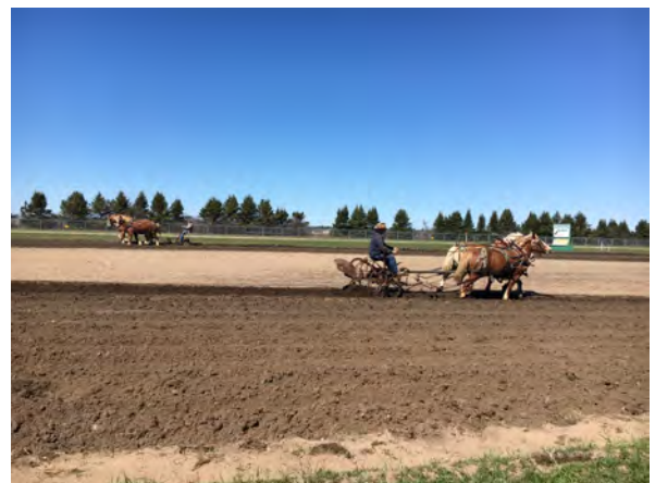
Community Garden being tilled