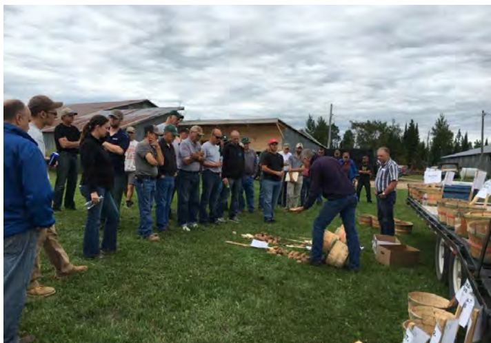
Potato Field Day

The purpose of the potato variety trial and field day is to educate Upper Peninsula potato growers on new varieties, variety trial results and new techniques including cover crops use. The event was held in Cornell, MI at TJJ Farms in late August. Chris Long, MSU