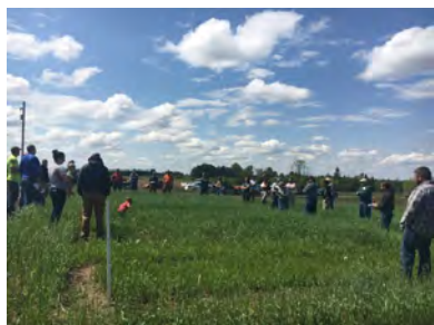
Cover Crop Field Day

Cover crops research is currently being conducted out on Brock Dairy farm in Carney, MI. 2016 research highlighted grass cover crops yields such as annual rye, cereal rye and triticale. A field day was held late-May allowing local farmers to tour the plots, hear other local farmers speak about their use of cover crops and provide information on locally available cover crop varieties. After the field day those in attendance were asked to voluntarily complete an evaluation. 96% would adopt cover crop practices, tools or technologies to increase yield, improve quality or decrease inputs. 50% improved their knowledge and intend to change their practices related to increase economic activity. 96% improved their knowledge and intend to change their practices related to improving production efficiency. Research is continuing in 2017 with variety selection of cover crops for corn production.