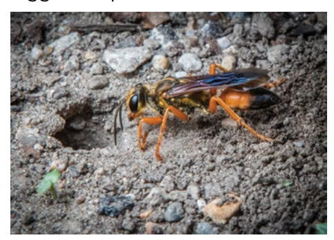
A great golden digger wasp stands at the entrance hole of its nest.

One of the most interesting aspects of digger wasps is their repetitive behavior; moving in and out of a nest, carrying small rocks. soil and other bits only to fly away and return with a paralyzed katydid to lay in a very precise way in front of their nesting hole. The katydid is always positioned at the "proper angle" so that after a quick check of the nest, the wasp can drag the katydid by the antennae into the hole making an excellent meal for a developing digger wasp larva.