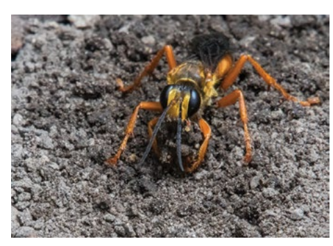
The wasp detects a katydid nearby.