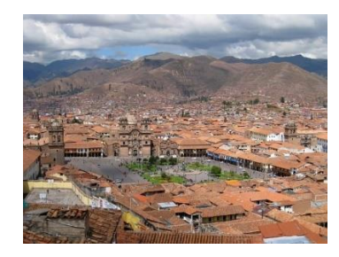
View on the Plaza de Armas, Cusco

The rest of the day you have free to acclimatize to the altitude and enjoy the amazing Cusco city center on your own pace. Relax in the hotel, visit the Plaza de Armas or even head up to the San Blas neighborhood to enjoy some stunning views of Cusco and the Cusco Valley. Cusco is also known for its great shopping opportunities. You can find several large artisanal markets around.