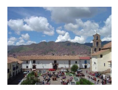
View from the Plaza San Blas, Cusco