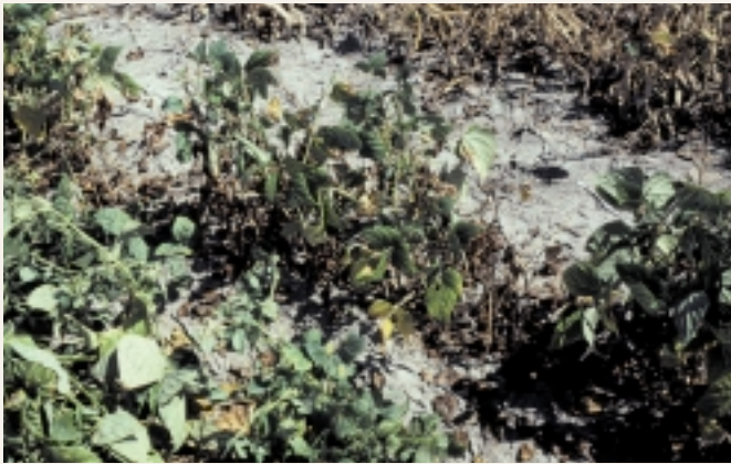
Figure 3. Black root symptoms in the field. Entire plantings of beans may die.