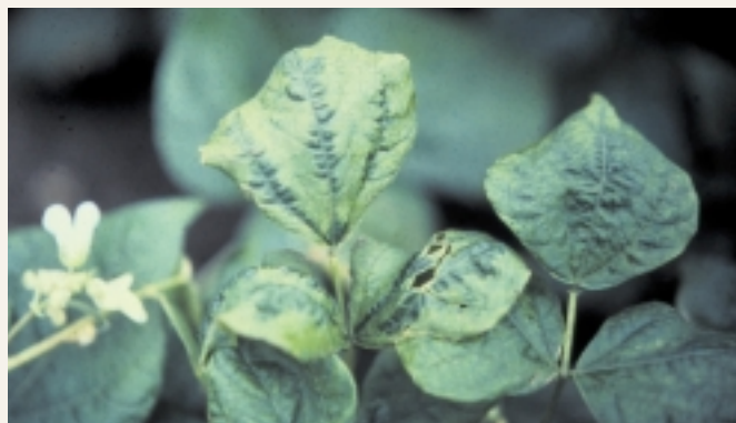
Figure 1a. Leaf puckering and mosaic symptoms (alternating areas of light and dark green) characteristic of the susceptible reaction to BCMV and BCMNV.

In varieties possessing the dominant I gene, BCMNV causes black root disease (Fig. 3). Symptoms of the hypersensitive black root reaction begin as small, red-brown spots on leaves that expand into a dead area, and eventually the