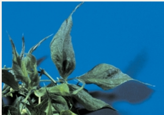
Figure 1b. Typical leaf distortion in susceptible bean plants infected with BCMV and BCMNV. Note the elongated and rolled up leaves.