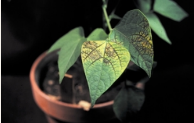
Figure 2. Hypersensitive reaction observed on inoculated leaves of plant in the greenhouse. Note: The resulting plant death is due to inoculation with BCMNV.

death of the whole plant (Figs. 2 and 3). Certain strains of BCMV can cause black root in I gene varieties only at high temperatures (above 90 degrees F). The death of plants as a result of the hypersensitive reaction prevents the plants from serving as a source of inoculum or infected seed for the next planting generation. When black root affects a large number of plants in the field, substantial yield losses result (Fig. 3).