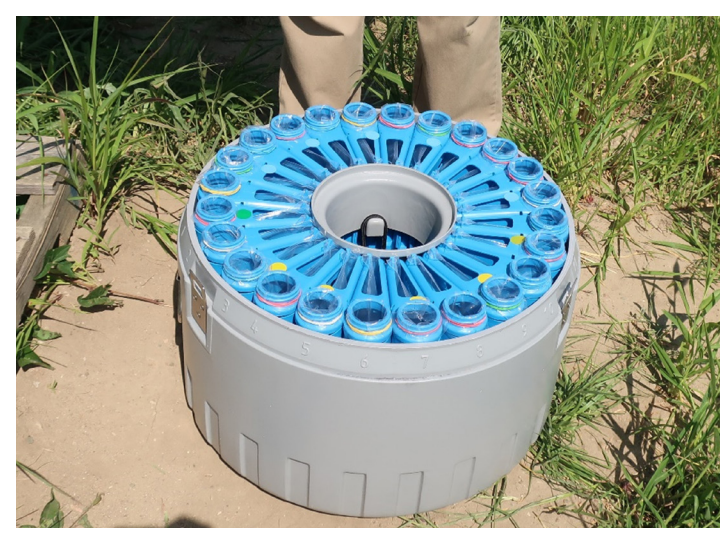
Figure 1- An automated sampler can perform flow-proportional or time-proportional sampling.

For estimating the annual P load, you can use flow-proportional compositing for both drainage discharge and surface runoff. This strategy needs an automated sampler and a flow rate sensor to trigger the sampling (Figure 1). In this method, the sampler takes an aliquot when a certain flow depth has occurred. Flow depth is flow volume divided by drained area (defined as flow depth interval). Then, the sampler pumps the aliquot into a bottle. The decision of the aliquot number depends on the volume of the aliquot, capacity of the bottle, and project budget.