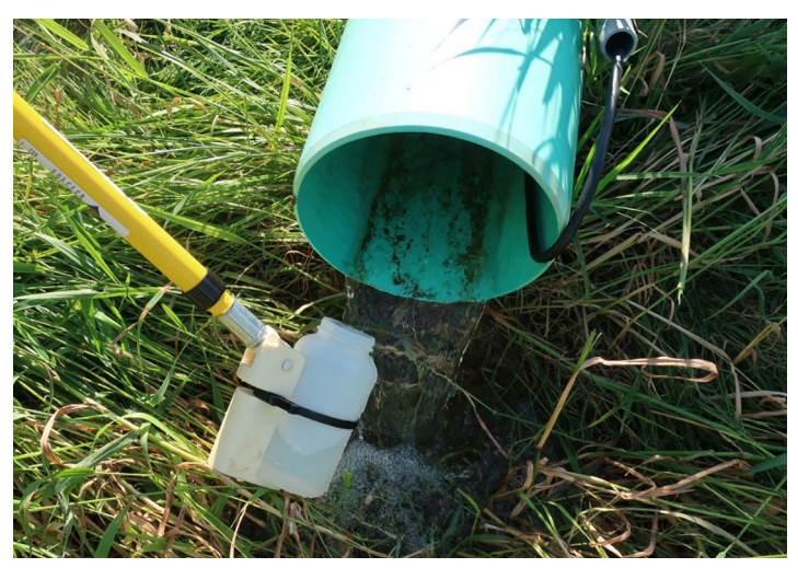
Figure 3- Grab sampling from the subsurface drainage discharge.

It is challenging to take daily grab samples during every day of the event flows, so longer sampling intervals are sometimes used. The error of a grab sampling strategy that does not cover every day of the event flows can be even greater than those reported in this section. Because of the high error of the grab sampling, it is important to report the uncertainty of the annual P load estimation.