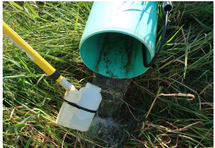
Figure 3- Grab sampling from the subsurface drainage discharge.

It is challenging to take daily grab samples during every day of the event flows, so longer sampling intervals are sometimes used. The error of a grab sampling strategy that does not cover every day of the event flows can be even greater than those reported in this section. Because of the high error of the grab sampling, it is important to report the uncertainty of the annual P load estimation.