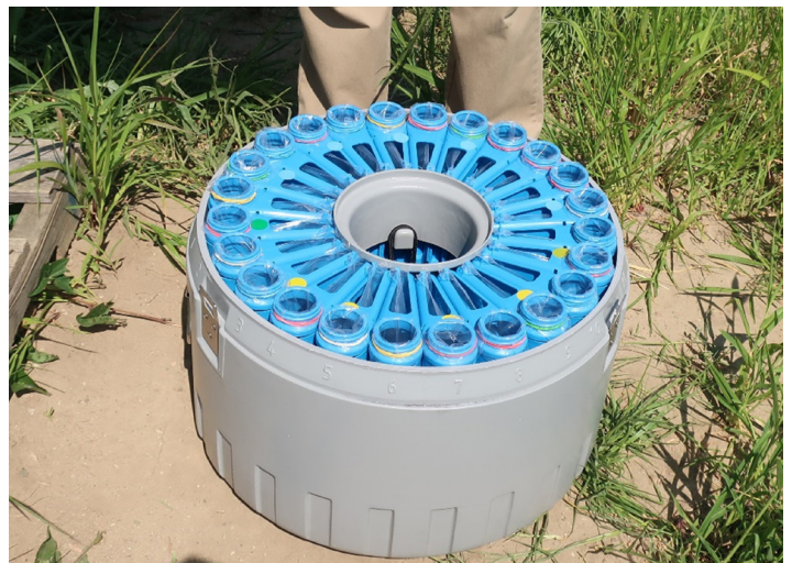
Figure 1- An automated sampler can perform flow-proportional or time-proportional sampling.

For estimating the annual P load, you can use flow-proportional compositing for both drainage discharge and surface runoff. This strategy needs an automated sampler and a flow rate sensor to trigger the sampling (Figure 1). In this method, the sampler takes an aliquot when a certain flow depth has occurred. Flow depth is flow volume divided by drained area (defined as flow depth interval). Then, the sampler pumps the aliquot into a bottle. The decision of the aliquot number depends on the volume of the aliquot, capacity of the bottle, and project budget.