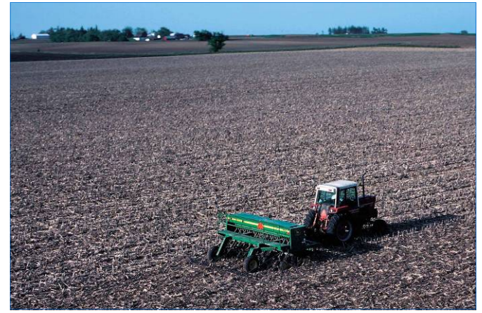
Conservation measures like no-till are eligible for NRCS financial assistance.

The ultimate goal of NRCS is to ensure that our natural resources will be preserved for future generations. By developing a conservation plan and implementing conservation measures on your farm, your land will continue to be productive for future generations of farmers. You will also help improve the quality of the air and water we all share.