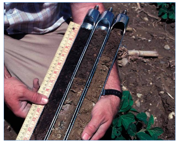
NRCS has extensive soils information including soils maps for every Michigan county.

http://websoilsurvey.nrcs.usda.gov/app/.