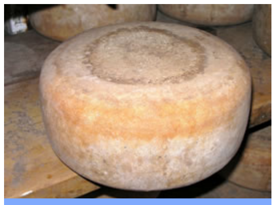
Raw milk Gouda produced by Steve-N-Sons Grassfields Cheese, located in Coopersville, MI.

or somewhat important in parentheses): humane animal treatment (82%), not produced with antibiotics or hormones (87%), environmentally friendly (93%), raised in Michigan (52%) and raised on a family farm (63%). The top reason given for not purchasing, or not purchasing more, pasture-raised products was lack of availability[67]. In addition, 81% either strongly agreed or somewhat agreed that pasture-raised products are healthier for consumers than products from confined feeding operations. This does not mean that pasture-raised products are necessarily healthier, but that consumers think that they are. In fact, a recent report from the Union of Concerned Scientists reviews the literature on nutritional attributes of pasture based cow-products; identifying the boundaries of accurate messaging[68].