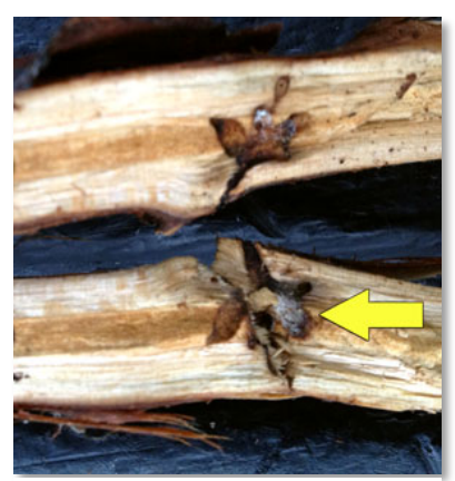
Figure 1. Brood galleries where eggs are laid and larvae develop. Whitish material is Ambrosia fungus, which is the food for both larvae and adults.

Black stem borer biology. Overwintering adults are found in galleries at the base of infested trees and become active in late April or early May, after one or two consecutive days of 68°F or higher, often coinciding with blooming forsythia (6). Adults are about 2mm (0.08 in.) long and females outnumber males by 10 to 1. Only the females are known to fly, and once mated they bore into young trees to create brood chambers consisting of a series of tunnels and chambers called galleries. The entrance to each tunnel is about 1mm (0.04 in.) in diameter and