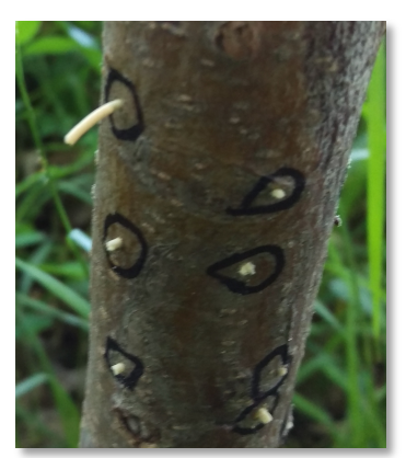
Figure 3. Sawdust toothpicks protruding from black stem borer entry holes; wind and rain easily knock them off the trees.