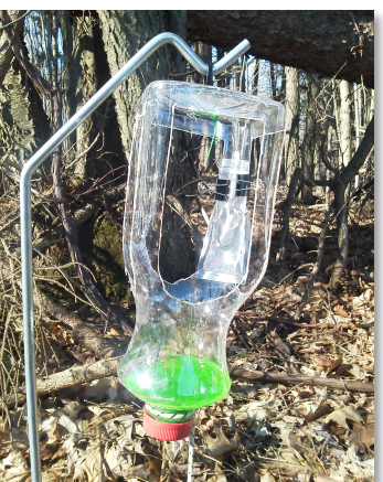
Figure 4. Simple trap; inverted juice container with sides cut away.