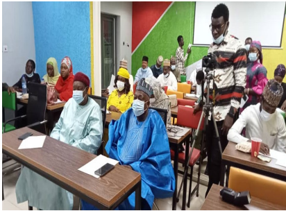
Cross section of Participants at the workshop with the Kebbi State Commissioner for Agriculture and Natural Resources and Permanent Secretary of the Ministry