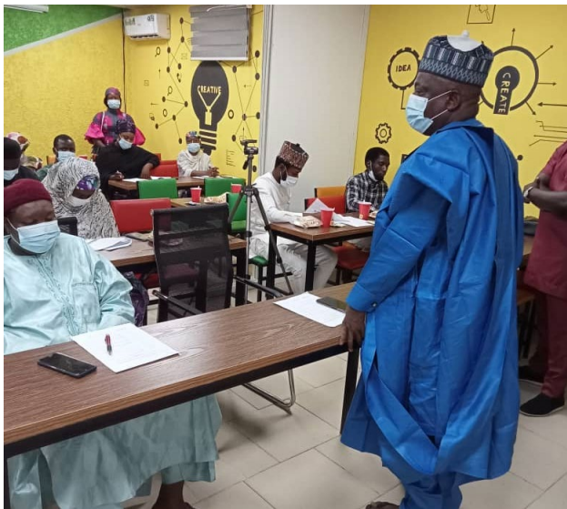
Contribution from the Kebbi State Commissioner for Agriculture and Natural Resources