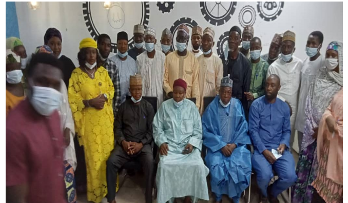
Cross section of participants after the workshop