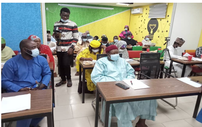
Cross section of participants filling the perception survey on the business environment for agri enterprises (pre-evaluation test)

The roundtable workshop commenced with the participants filling out a perception survey on the business environment for agri-enterprises. The survey served as a baseline information on participants' knowledge of policy issues and the existing policy framework. The survey was arranged in three sections, each section containing the framework for one of the 3 sessions. These sessions were: 1) business environment in the State (opportunities and challenges), 2) business environment for agri-food enterprises, and 3) the regulatory framework for agri-enterprises at the state, national and regional level. The African Continental Free Trade Area agreement being in focus under this session. Findings from the session on AfCFTA revealed an appreciable level of awareness of AfCFTA. Some of the participants were engaged in agro-exports.