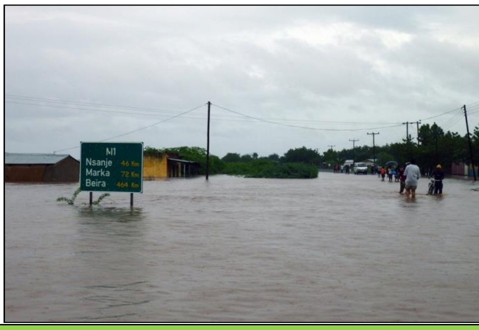
AGRICULTURE POLICY UPDATES IN MALAWI