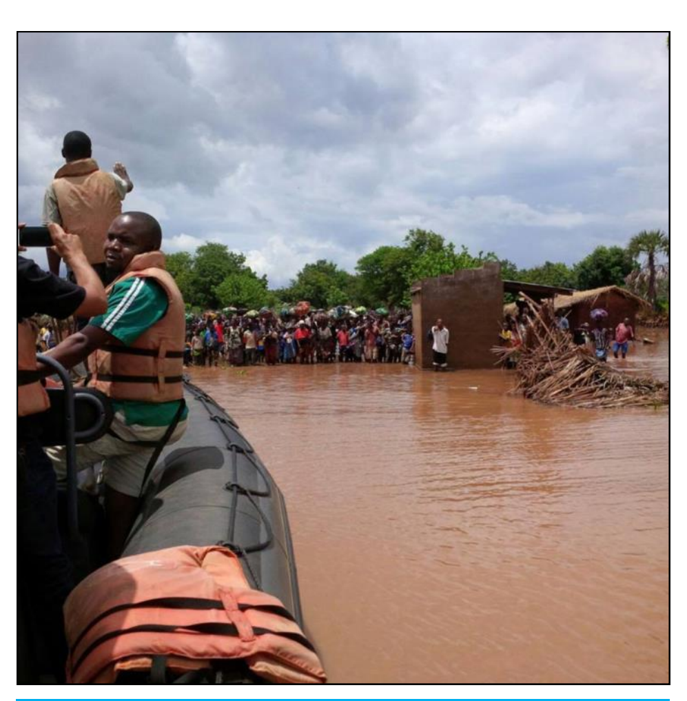
Malawi Defence Force personnel in boat rescuing stranded flood victims in Nsanje (ABOVE Road leading to Nsanje at Bangula roundabout shows extent of flooding (BELOW)

The policy is aimed at ensuring that Disaster Risk Management (DRM) is mainstreamed in development planning and policies of all sectors in order to reduce the impact of disasters and ensure sustainable development in the country.