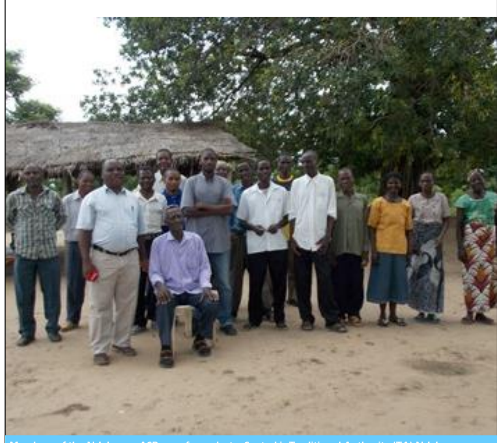
Members of the Ndakwera ASP pose for a photo. Seated is Traditional Authority (TA) Ndakwera