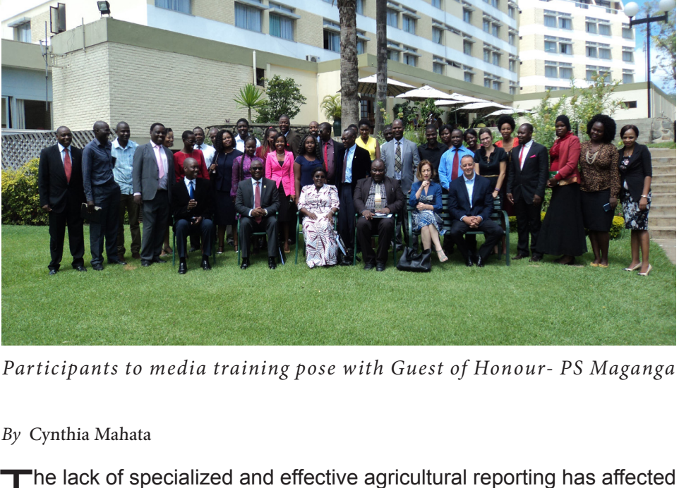
Malawi's agriculture sector in many ways than one. Most Journalists in the country lack the basic agricultural knowledge needed to produce deep, informative stories with a positive impact. Seeing this need, Farmers Union of Malawi (FUM) and NAPAS joined hands and funded a training

EFFECTIVE REPORTING FOR A TRANSFORMED AGRICULTURE SECTOR